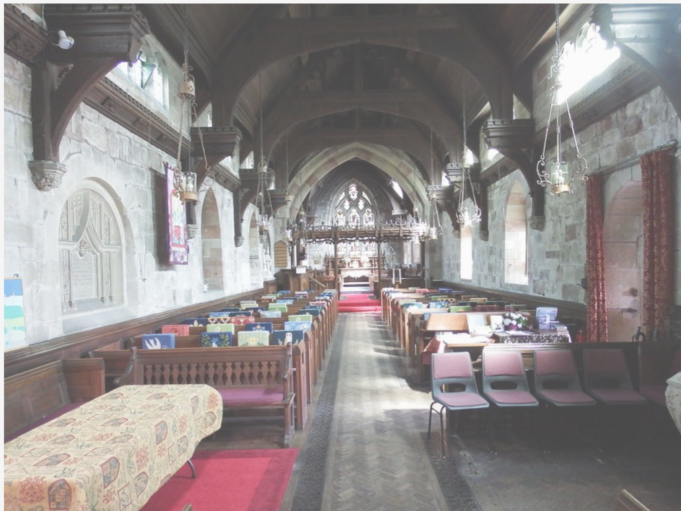
Interior to E